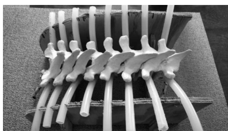
Figure 1 - Photograph of the model constructed of plastic thoracic vertebrae T2-T9 and a rib structure of polyethylene tubing supported in a plywood carriage.

knot farther up on the cord. The bungee tension then could be controlled to any particular vertebra independently and 1 side or the other.