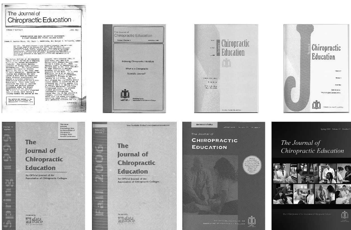
Figure 3 - Upper left to right: the inaugural issue of the JCE (1987), the first bound issue printed in the colors forest green and silver in the year that the ACC assumed ownership (1989), the year of the chiropractic centennial (1995), cover during the final year of the first editor Dr Grace Jacobs (1997). Lower left to right: format changed to a full paper size (1999), the year the journal first provided electronic access (2006), the covers include a symbolic image of a chiropractic teaching moment and announce the inclusion of the journal in PubMed (2009), the cover in full color with multiple teaching moments representing the spirit of chiropractic education (2013).