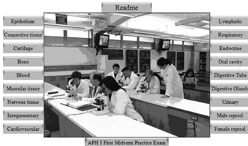
Figure 1. User interface page of the interactive atlas of histology.